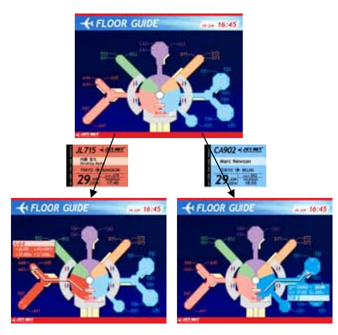
Figure.3 Screen Shots of Airport Scenario

Fig.3 shows some screenshots of an airport scenario. In an airport, there are flight information guide and gate map on large screen already. In general, users have to find out their concern information from many candidates showed on display. Using UBWALL we can avoid these inconveniences. We describe the scenario with UBWALL as follows: