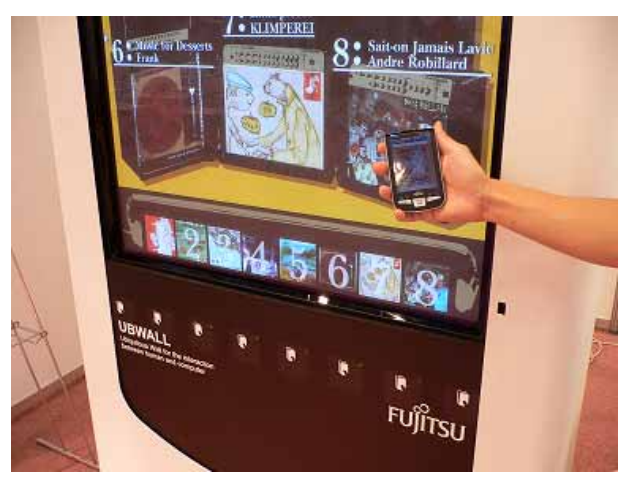
Figure.4 Display Image of Music Shop Scenario

UBWALL works for sales Assistance as a "KIOSK Board". It indicates "awareness", which assists shopping depending on customer's history, and helps sales promotion as well. Fig.4 shows display and PDA image of music shop scenario.