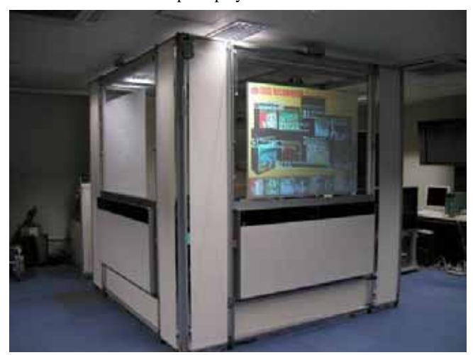
Figure.2 UBWALL Projector model

UBWALL has different models: one is a PDP (Plasma Display Panel) model assembled with 63 inch PDP standing lengthwise, as shown in Fig.1, and another is a projector model assembled with 64 inch glass-screen standing breadth wise in a wall of aluminum-framed small house, as shown in Fig.2. Other input/output devices and sensors are the same for both of two models except display unit.