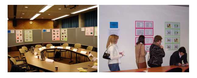
Figure 1: Exhibition rooms at different partner sites.

with a large table and chairs, refreshments, paper, pencils and as an exhibition room showing the visualization of the scenarios. In the reception room, the participants received a general introduction and a short instruction on the tasks that they had to perform in the exhibition room.